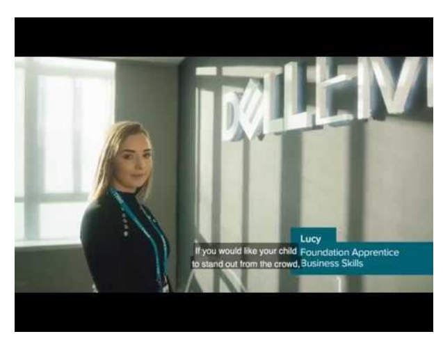
2 - Have you seen the TV advert?

For details on the local delivery plans please contact your local learning providers or get in touch with Skills Development Scotland by registering an interest through <a href="https://www.apprenticeships.scot/Foundation">www.apprenticeships.scot/Foundation</a> and searching by your school. You can also email them directly at <a href="mailto:newapprenticeships@sds.co.uk">newapprenticeships@sds.co.uk</a> and they will connect you to your local learning providers.